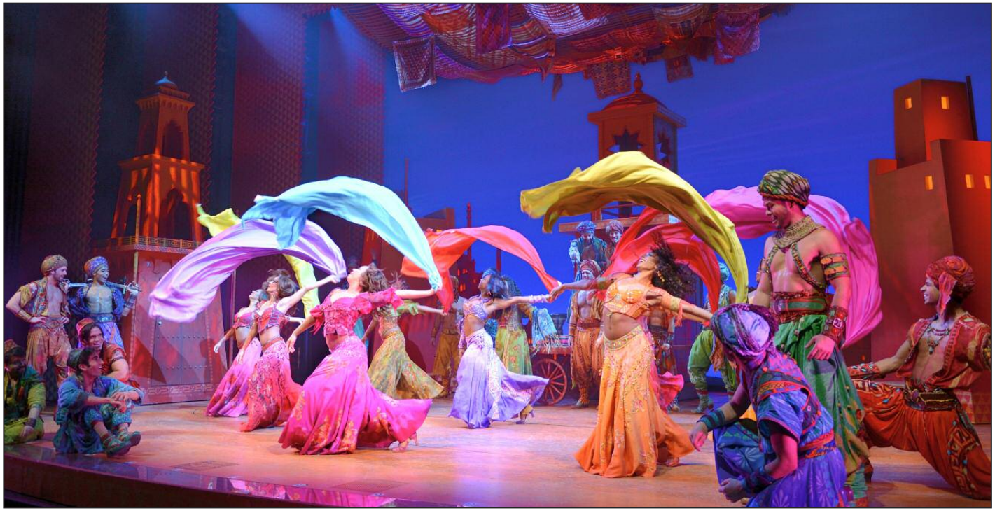
Aladdin North American Tour.

See 2nd page for prices and seating chart