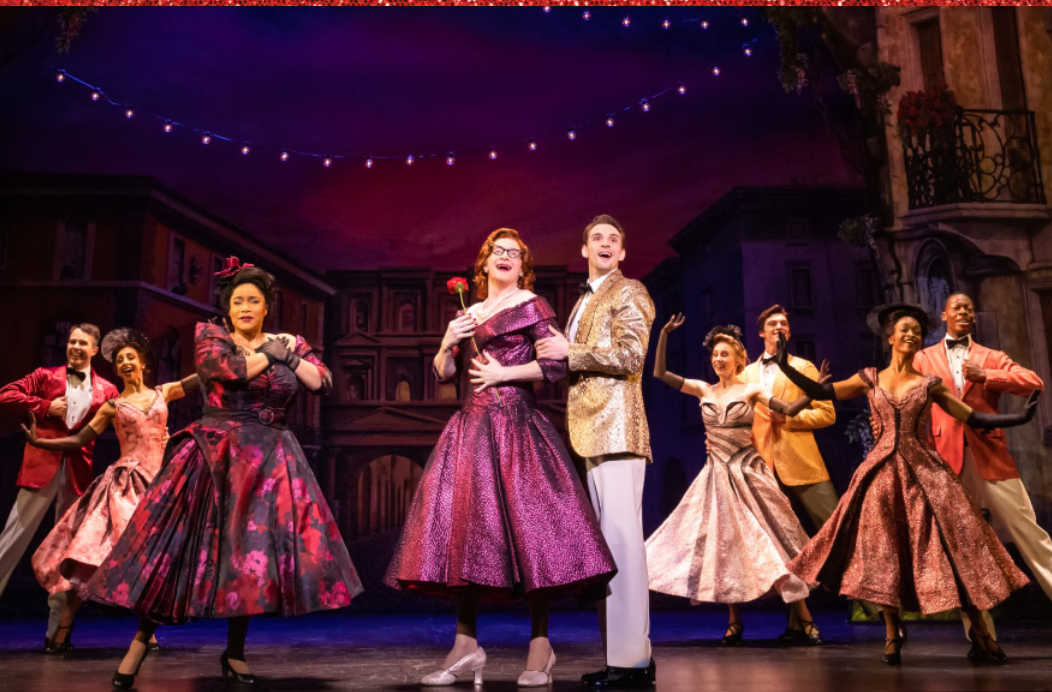
The cast of the National Tour of TOOTSIE.