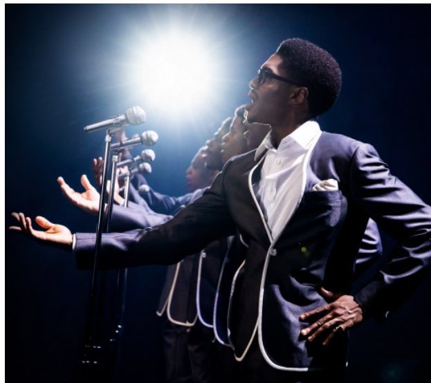
National Touring Company of Ain't Too Proud.