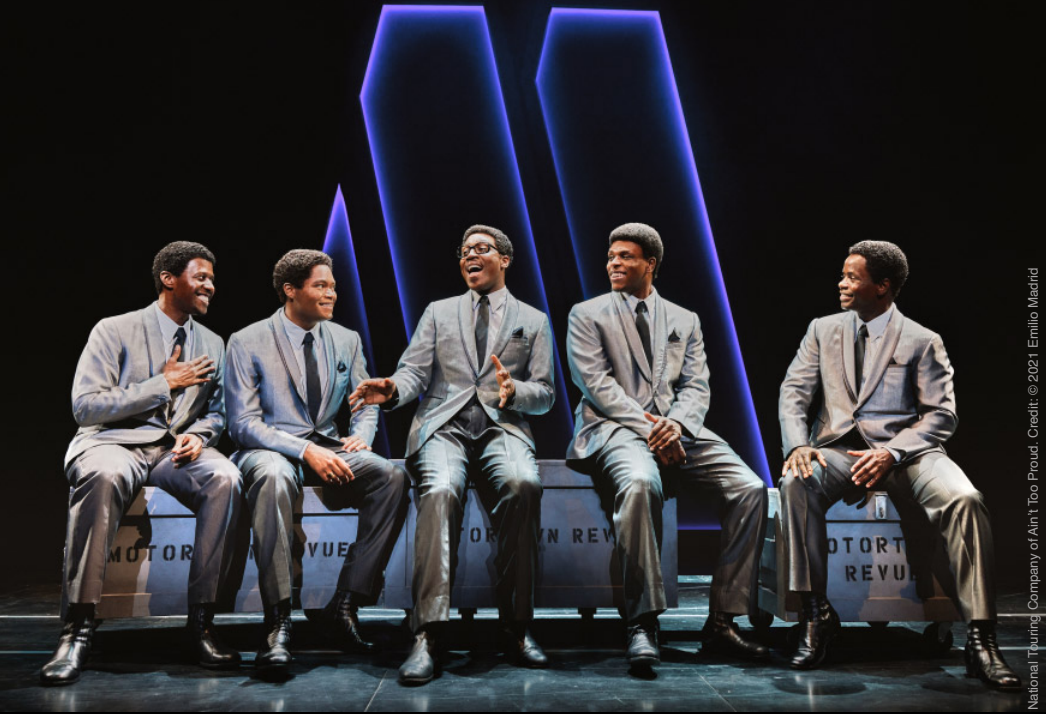
National Touring Company of Ain't Too Proud.