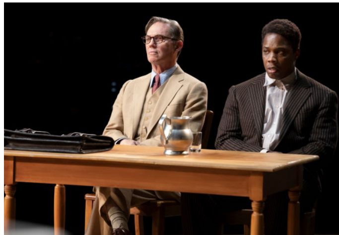
Harper Lee's To Kill a Mockingbird National Tour.