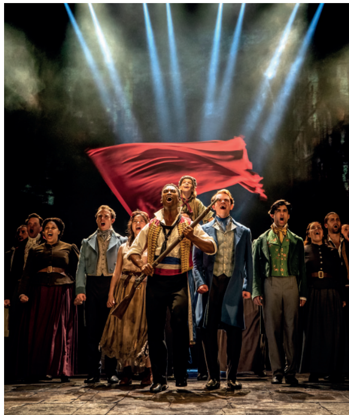
Les Misérables National Tour.

WICKED included in the Eight-Show Season Ticket package.