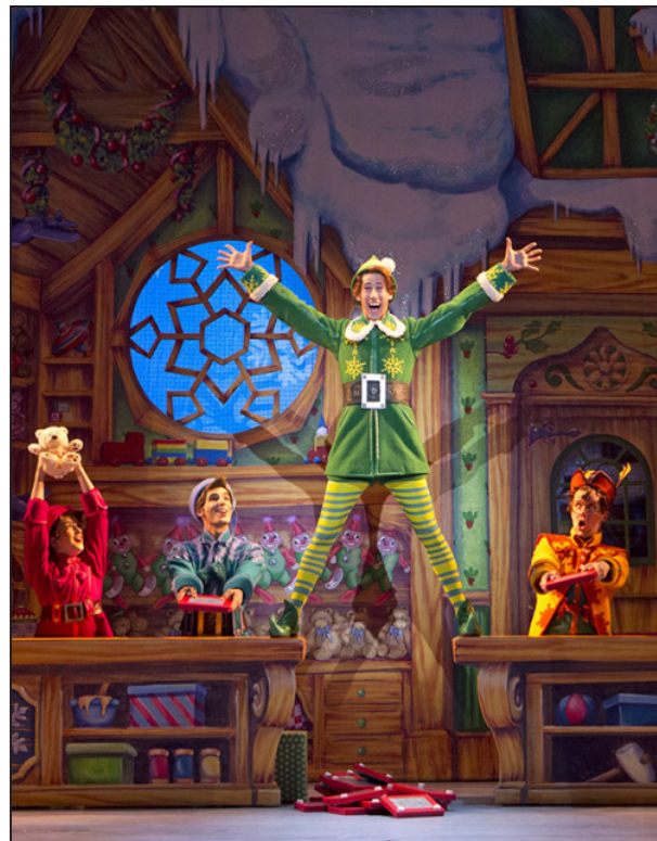
ELF-Christmastown.

Gather your friends and family for an outing you will always remember.