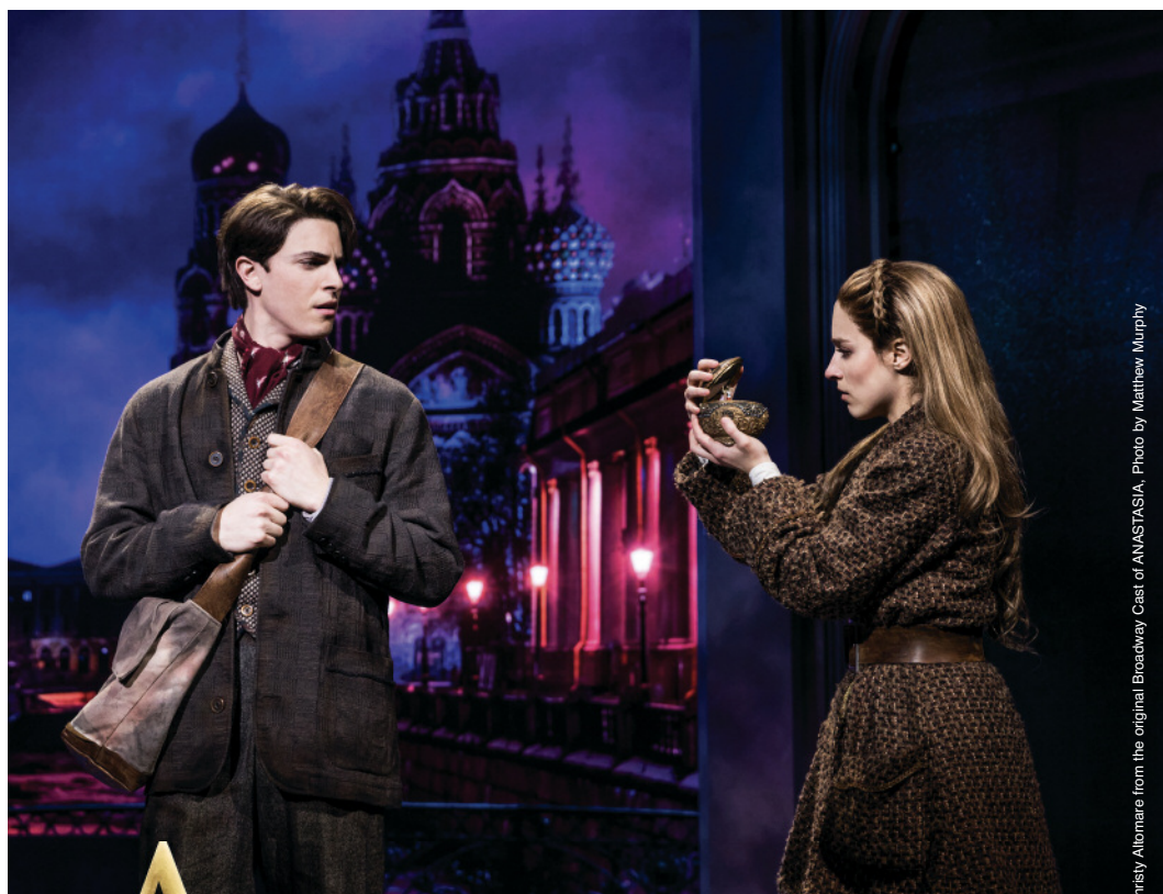
Christy Altomare from the original Broadway Cast of ANASTASIA