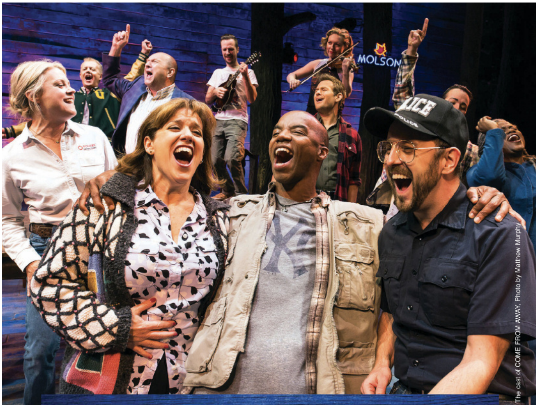
The cast of COME FROM AWAY.