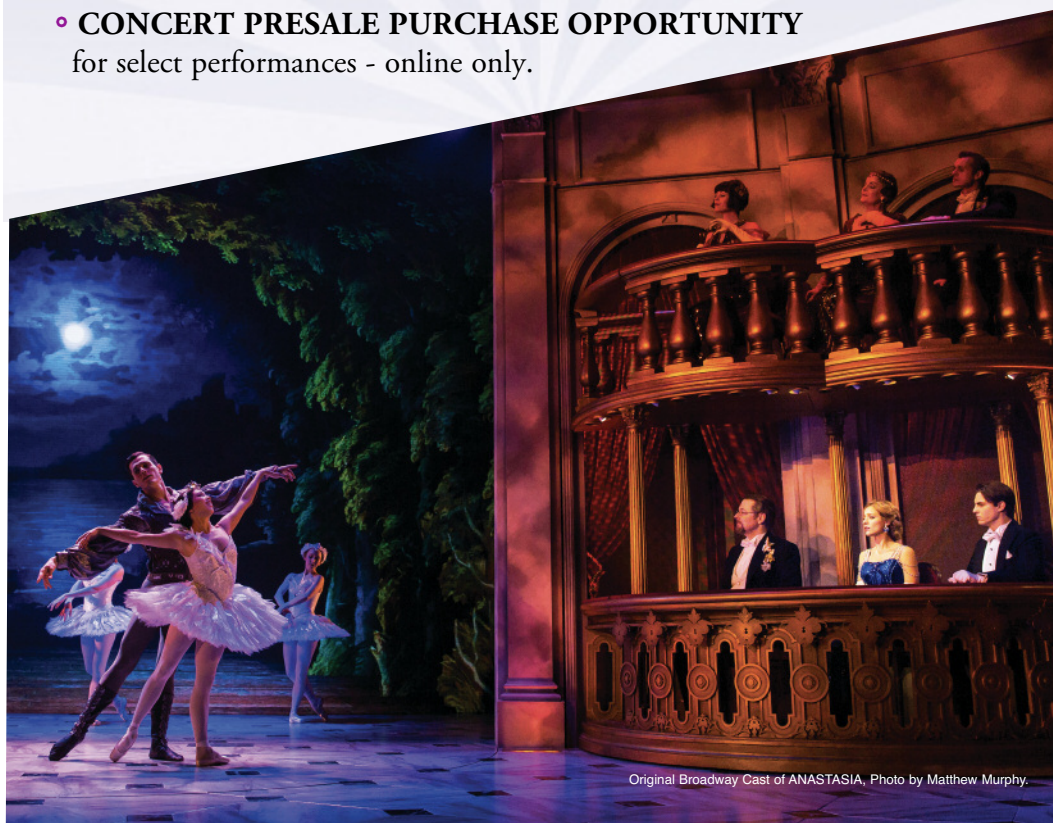
Original Broadway Cast of ANASTASIA

Season ticket holders may choose from two weeks of performances with times and days as listed below