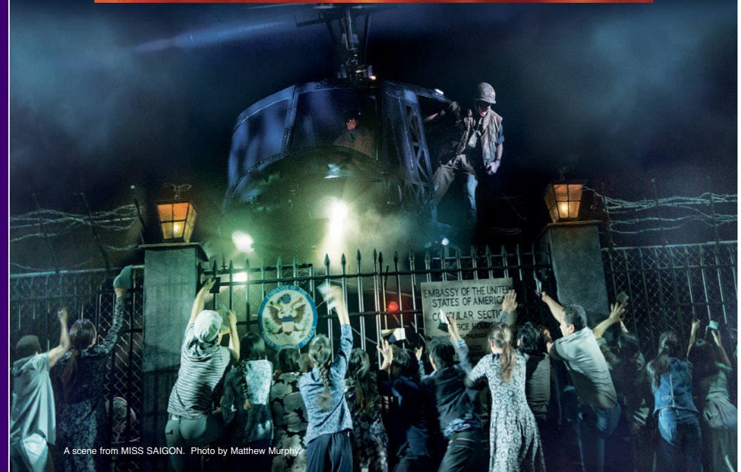
A scene from MISS SAIGON.