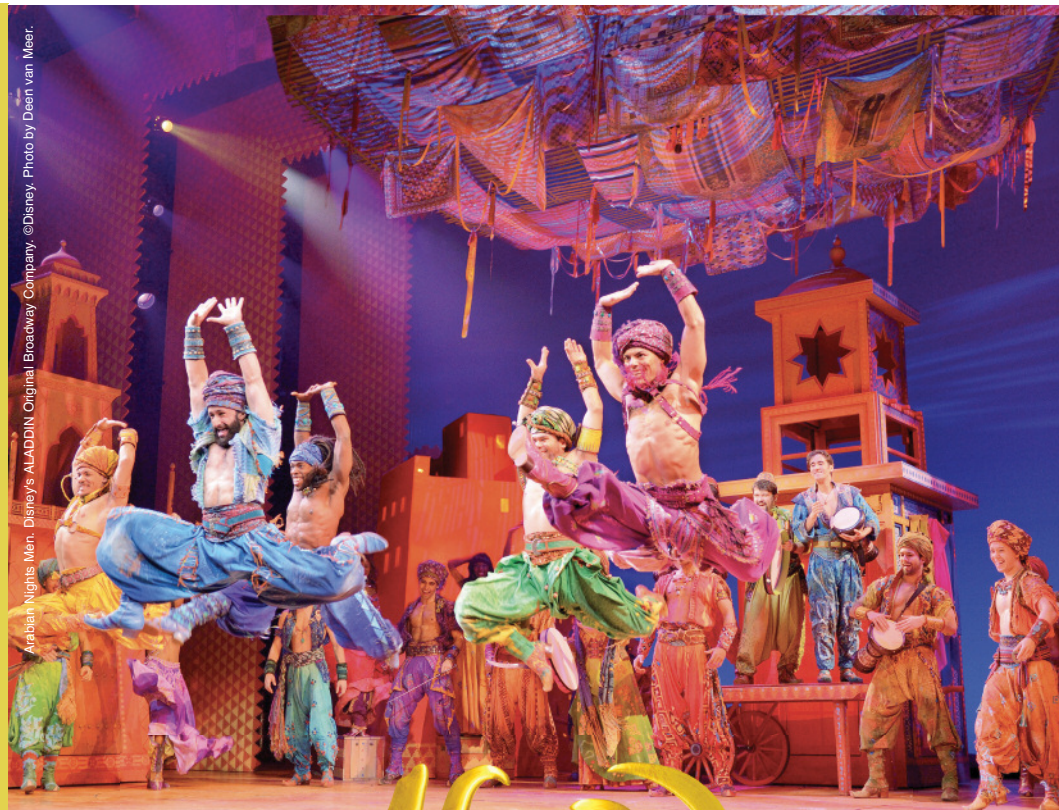
Arabian Nights Men. Disney's ALADDIN Original Broadway Company.