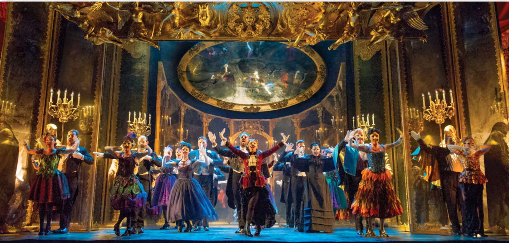
The Company performs "Masquerade."