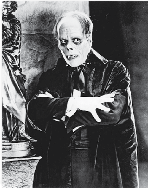
Lon Chaney in The Phantom of the Opera (1925)

Leroux saw in the Opera House a mirror of the Belle Époque society that passed through its halls: beautiful, stately, and refined on the outside, but just below the surface, a dark undercurrent of secrecy and horror. In a feverish three months, often bounding out of bed in the middle of the night to scribble down an image from his nightmares, he completed what would be his most memorable work. The Phantom of the Opera was born.