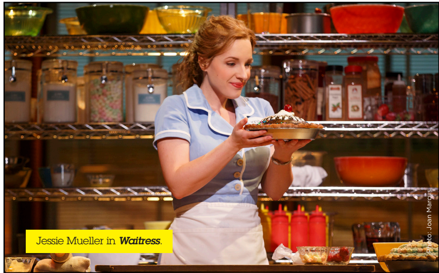
Jessie Mueller in Waitress .

An inquisitive actress who is deeply inspired by the developmental process, Mueller’s exploration of her character’s psychology and voice in rehearsal is invaluable. She explains that the relationship among Waitress director Diane Paulus, book writer Jessie Nelson, and composer Sara Bareilles has influenced her own collaborative approach to new work. “I like the way those ladies all work together,”