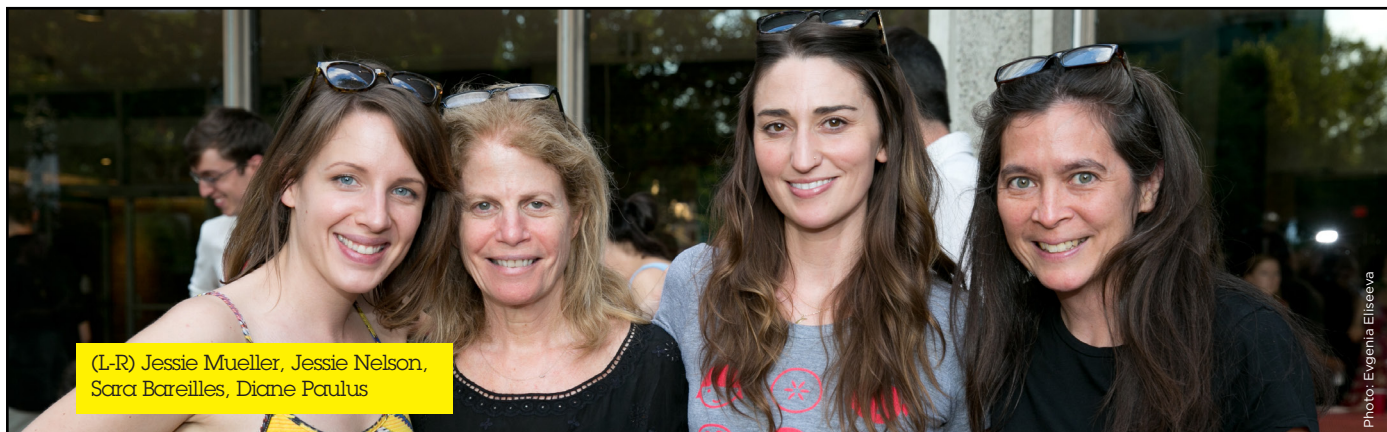
(L-R) Jessie Mueller, Jessie Nelson, Sara Bareilles, Diane Paulus

Waitresses work across the entire American landscape. We asked members of the Waitress team to share some of their own experiences as, or with, waitresses and waiters.