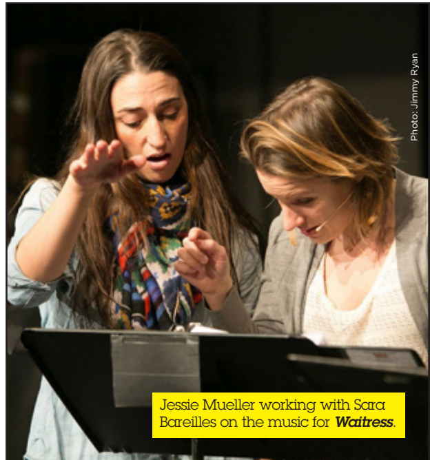
Jessie Mueller working with Sara Bareilles on the music for Waitress .

The daughter of two actors and sister of three siblings who are also all performers, Mueller grew up in suburban Chicago surrounded by theater. She never felt pressured by her family to perform, but was attracted to the process and culture of theater. “It was my parents’ job and I understood there was a lot of work involved from an early age,” she remembers. “But I also saw the camaraderie. I saw my parents’ friends with them after a show. I saw that world – it’s unlike anything else.” Mueller began acting in high school, and later studied theater as an undergraduate at Syracuse University. Returning to Chicago after graduation, she was quickly recognized for her remarkable voice and captivating stage presence. Within a year, Mueller landed a role at the Chicago Shakespeare Theater, and then continued to perform at many of Chicago’s leading theaters, winning her first Joseph Jefferson Award in 2008 in Carousel and another in 2011 in She Loves Me . In