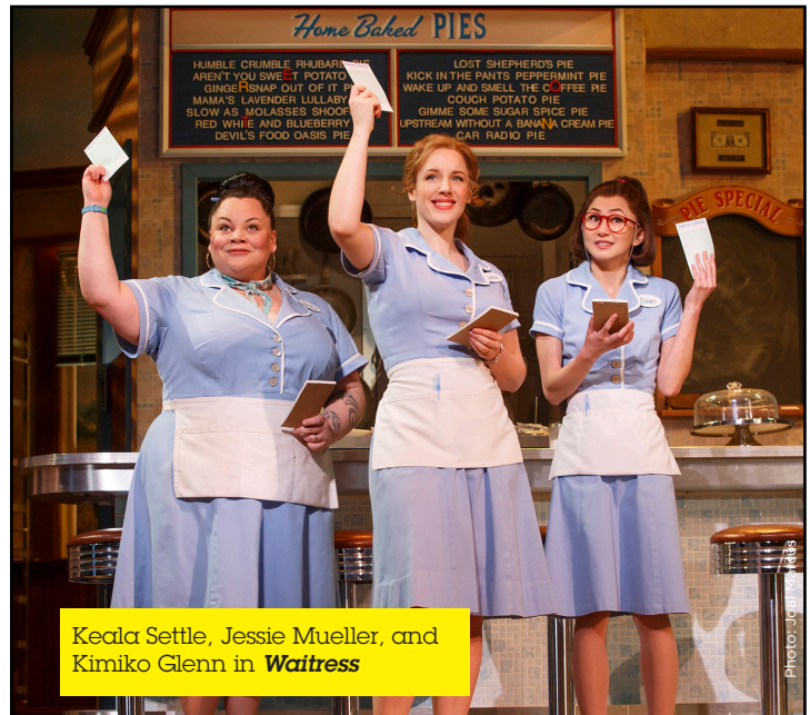
Keata Settle, Jessie Mueller, and Kimiko Glenn in Waitress

When diners first popped up in America, servers and short-order cooks quickly developed their own code words and phrases for the food and people in the diners. Below are a few classic diner lingo terms and what they mean.